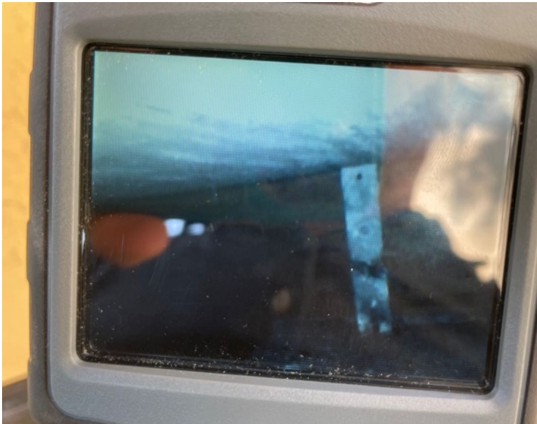
Clip Connection found using Endoscope (Checked several locations and found to be consistent at multiple locations)